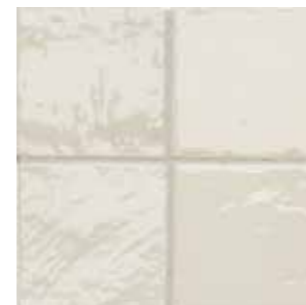
0201000 Bianco Cipria 10x10 . 4"x4"