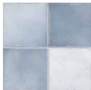
112110 Blu 10x10 . 4"x4"