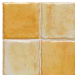
112145 Giallo 10x10 . 4"x4"