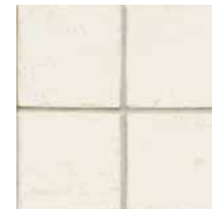
0201050 Champagne 10x10 . 4"x4"