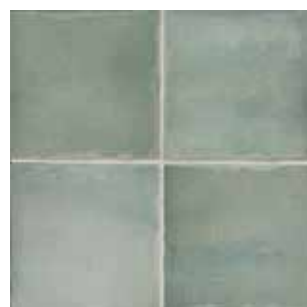
112190 Verde 10x10 . 4"x4"